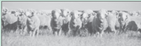
1998 drop Pooginook rams June 1999