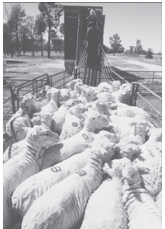
Freshly shorn P/GK ewes being loaded bound for WA.