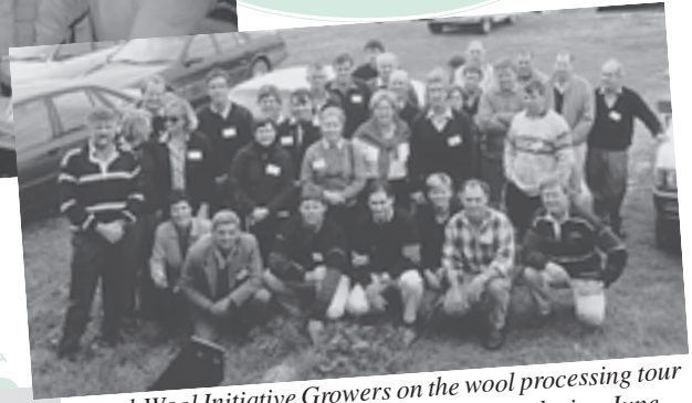
Pooginook Wool Initiative Growers on the wool processing tour participants, a busy but informative 3 day tour during June.