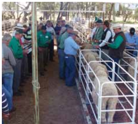
Pooginook Ram Sale 2009

Pooginook will again have a well grown selection of rams available for private sale from mid September onwards. Up to 1000 rams will be available from Pooginook in grades from $500 up to $1000. Further inquiries are welcome. Contact the Sales Manager, Pat Brown for an appointment on 02 6954 4676.