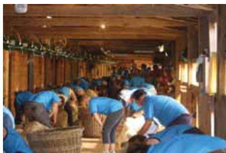
Pooginook Rams involved in the re-enactment of Tom Roberts Painting "The Shearing of the Rams"